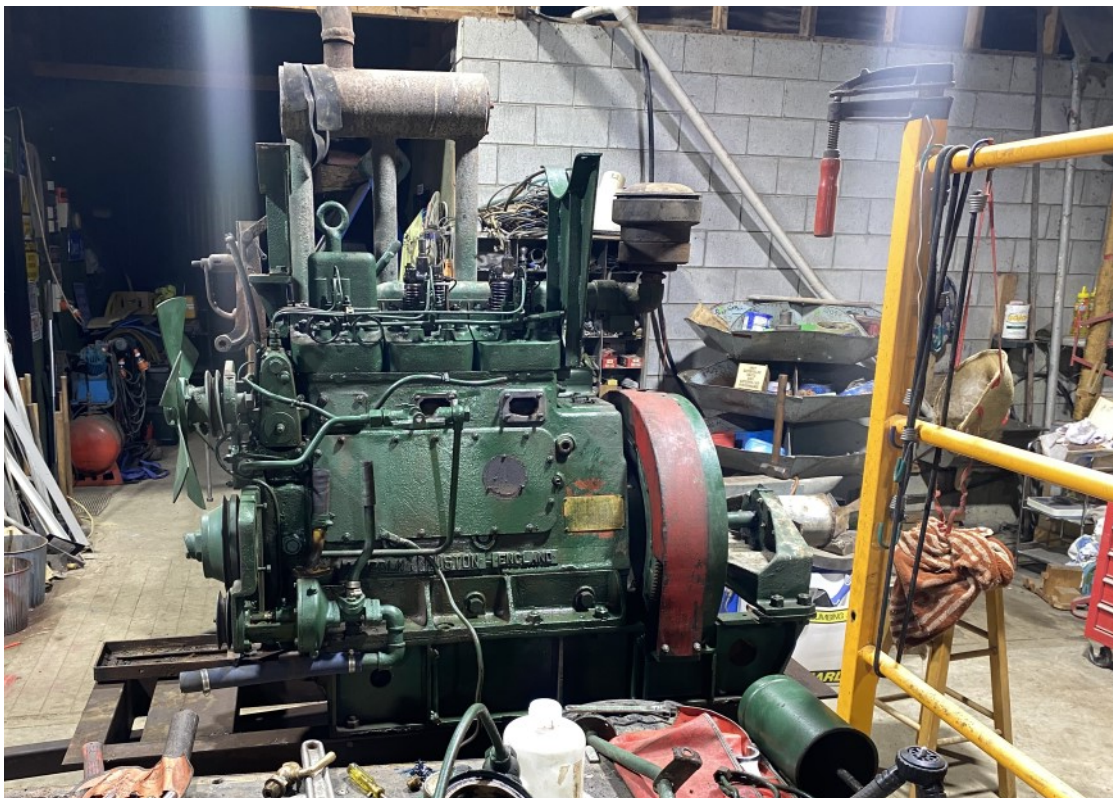
The 10-RB's 3 cylinder Ruston diesel engine in the workshop and receiving attention after many years of services